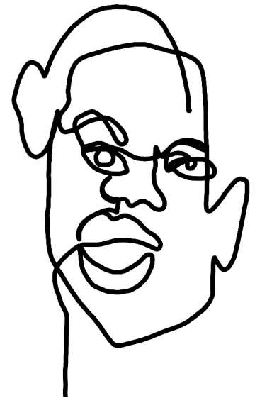
"Portrait of Abmaud Arbery"