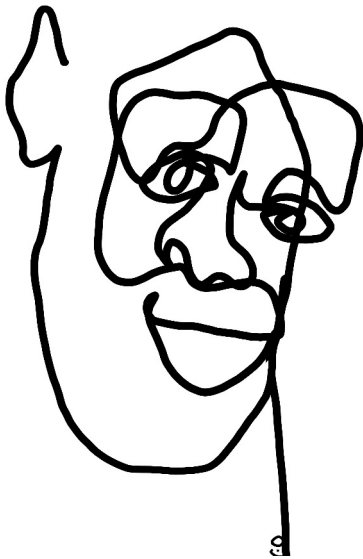
"Portrait of George Floyd"